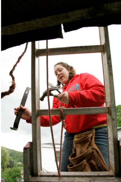
A young volunteer with a Catholic-run charity helps fix up a home in a poor area of West Virginia in this photo from last May. In his first encyclical, "Deus Caritas Est" ("God Is Love"), Pope Benedict XVI points to New Testament passages that emphasize the bond between love of God and love of neighbor.

15. This principle is the starting-point for understanding the great parables of Jesus. The rich man (cf. Lk 16:19-31) begs from his place of torment that his brothers be informed about what happens to those who simply ignore the poor man in need. Jesus takes up this cry for help as a warning to help us return to the right path. The parable of the Good Samaritan (cf. Lk 10:25-37) offers two particularly important clarifications. Until that time, the concept of "neighbour" was understood as referring essentially to one's countrymen and to foreigners who had settled in the land of Israel; in other words, to the closely-knit community of a single country or people. This limit is now abolished. Anyone who needs me, and whom I can help, is my neighbour. The concept of "neighbour" is now universalized, yet it remains concrete. Despite being extended to all mankind, it is not reduced to a generic, abstract and undemanding expression of love, but calls for my own practical commitment here and now. The Church has the duty to interpret ever anew this relationship between near and far with regard to the actual daily life of her members. Lastly, we should especially mention the great parable of