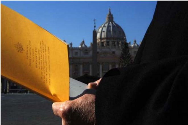
A priest reads Pope Benedict XVI's new encyclical in St. Peter's Square at the Vatican Jan. 25. The nearly 16,000-word encyclical, "Deus Caritas Est" ("God Is Love"), calls for a deeper understanding of love as a gift from God.

7. By their own inner logic, these initial, somewhat philosophical reflections on the essence of love have now brought us to the threshold of biblical faith. We began by asking whether the different, or even opposed, meanings of the word “love” point to some profound underlying unity, or whether on the contrary they must remain unconnected, one alongside the other. More significantly, though, we questioned whether the message of love proclaimed to us by the Bible and the Church's Tradition has some points of contact with the common human experience of love, or whether it is opposed to that experience. This in turn led us to consider two fundamental words: eros , as a term to indicate “worldly” love and agape , referring to love grounded in and shaped by faith. The two notions are often contrasted as “ascending” love and “descending” love. There are other, similar classifications, such as the distinction between possessive love and oblation love ( amor concupiscentiae – amor benevolentiae ), to which is sometimes also added love that seeks its own advantage.