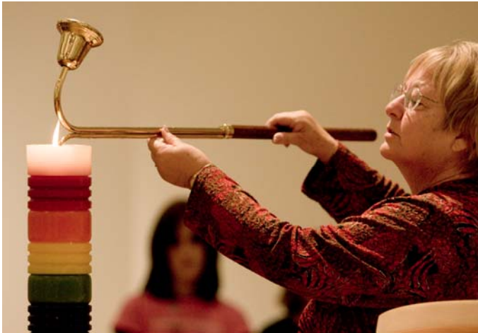
A candle is lit during an interfaith prayer service for victims of Hurricane Katrina at St. Charles Borromeo Catholic Church in Livermore, Calif., in this photo from last September. Prayer should not be forgotten as the church tries to alleviate the immense needs around the world, said Pope Benedict XVI in his first encyclical, "Deus Caritas Est" ("God Is Love").

22. As the years went by and the Church spread further afield, the exercise of charity became established as one of her essential activities, along with the administration of the sacraments and the proclamation of the word: love for widows and orphans, prisoners, and the sick and needy of every kind, is as essential to her as the ministry of the sacraments and preaching of the Gospel. The Church cannot neglect the service of charity any more than she can neglect the Sacraments and the Word. A few references will suffice to demonstrate this. Justin Martyr († c. 155) in speaking of the Christians' celebration of Sunday, also mentions their charitable activity, linked with the Eucharist as such. Those who are able make offerings in accordance with their means, each as he or she wishes; the Bishop in turn makes use of these to support orphans, widows, the sick and those who for other reasons find themselves in need, such as prisoners and foreigners. 12 The great Christian writer Tertullian († after 220) 13 relates how the pagans were struck by the Christians' concern for the needy of every sort. And when Ignatius of Antioch († c. 117) 14 described the Church of Rome as “presiding in charity ( agape )”, 14 we may assume that with this definition he also intended in some sense to express her concrete charitable activity.