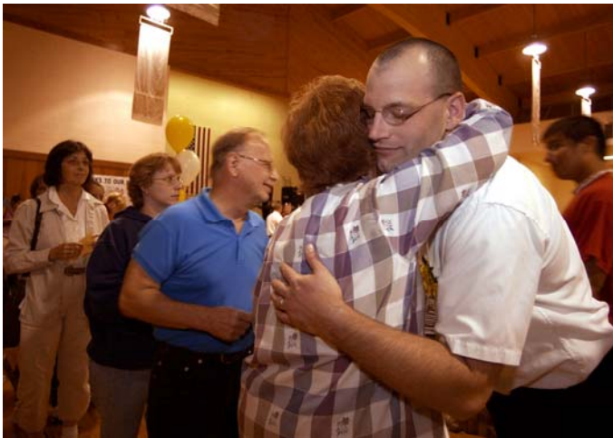
A cancer survivor greets the long line of people attending a benefit to help with his medical bills at a Catholic church in Griffith, Ind. In his first encyclical letter, Pope Benedict XVI said "love of neighbor is a path that leads to the encounter with God." The papal letter, "Deus Caritas Est" ("God Is Love"), was released at the Vatican Jan. 25.

understand why God refrains from intervening. Yet he does not prevent us from crying out, like Jesus on the Cross: “My God, my God, why have you forsaken me?” ( Mt 27:46 ). We should continue asking this question in prayerful dialogue before his face: “Lord, holy and true, how long will it be?” ( Rev 6:10 ). It is Saint Augustine who gives us faith's answer to our sufferings: “ Si comprehendis, non est Deus ”—“if you understand him, he is not God.” 35 Our protest is not meant to challenge God, or to suggest that error, weakness or indifference can be found in him. For the believer, it is impossible to imagine that God is powerless or that “perhaps he is asleep” (cf. 1 Kg 18:27 ). Instead, our crying out is, as it was for Jesus on the Cross, the deepest and most radical way of affirming our faith in his sovereign power. Even in their bewilderment and failure to understand the world around them, Christians continue to believe in the “goodness and loving kindness of God” ( Tit 3:4 ). Immersed like everyone else in the dramatic complexity of historical events, they remain unshakably certain that God is our Father and loves us, even when his silence remains incomprehensible.